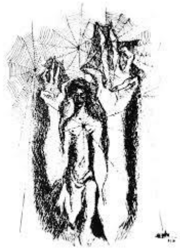
Illus: 7- Hands