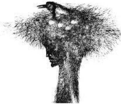
Illus: 4- Crow series

Sadequain thinks of himself as a man who imbibes wisdom by allowing the crow to weave nest and hatch eggs, implying his dare to dream and think creatively in a society that has long resigned to a quiet slumber. (illus: 4) He does not identify himself as another amongst the intellectual pygmies or a stooge to be decreed by a scarecrow. His path is the path of a rogue where he is content with his unconventional ways that would allow him to experience greater freedom of thought to exhume his inner self and find peace therein. The evolution of his thought process bears evidence that after having practiced his freedom he did attain some peace as depicted in the form of dove replacing crow on his head in one of his paintings.