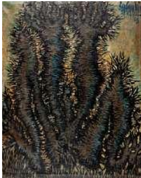
Illus:6- Mystic Figuration

The cacti which grow on their own, untamed, untended and fed on little nourishment extracted from soil, still grow to heights and strength. The contempt and callousness absorbed from their milieu grows on them in the form of spikes. Yet they don't complain and under their hard and thick skins they also contain the pure, untainted sap of life. Christa Paula in her lot 13 also puts forward the view that Sadequain finds these cacti akin to himself as he indicates in his drawing "the transforming cactus". To him the cacti are the recluses, the hermits standing in contemplative, pensive gestures raising their hands to the Divine in hope and faith. His painting "mystic figuration" (illus:6) is such an enticing piece of work in this regard saturated with the artist's soulful experience. The cactus appears as a seated human figure, exaggerated, deformed in the usual Sadequain's expressive rendition of his subjects. Befitting the context the cactus as an entity is rendered in strong dark colours, the blue and ochre; yet a mystifying light illuminates the background where the hands spell out the name "Allah" by means of placement of fingers of hands. 20