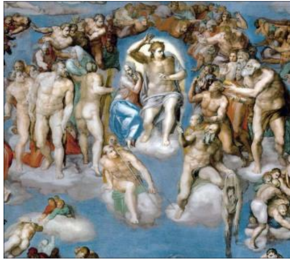
Illus: 2- The Last Judgment, Michelangelo

In order to understand and interpret Sadequain's work it is crucial to be acquainted with his inspirations. He approved and recognized much with all modern art movements specially Cubism, Surrealism and Expressionism. But Sadequain was also much inspired by the Renaissance artist Michelangelo in spirit of his ideals, and rendition of his subjects painted as metaphors for sublime concepts of irony of deeds and fate, salvation and redemption. He himself has said that he takes the divine Michelangelo to be his tutor and mentor. He was a tormented soul like Michelangelo who was in quest of salvation. His works are infested with such distressed images of man as are reminiscent of Michelangelo's Sistine Chapel ceiling. (Illus:2)