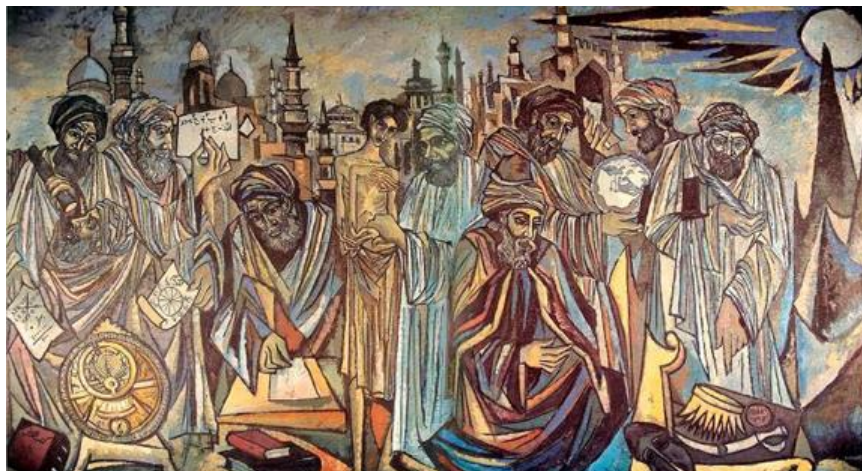
Illus: 3- Treasures of Time

shadows also imply that the scene belongs not to the material realm but the archetypal world in the ethereal realm. Artist's presence in this world therefore casts light on his spiritual aspirations. (Illus: 3)