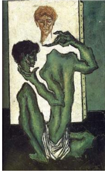
Illus: 8- The Artist

treated as a hindrance in the way of achieving intuitive faculty, and spiritual insight. This idea can further be probed by associating the decapitation with sacrifice. In all the works the headless body is carrying the severed head itself and still engaged in some action. (Illus: 8)